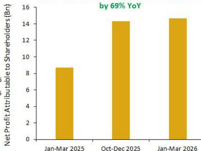
Cumulative Net Profit Attributable to Shareholders increased by 2% QoQ, increased by 69% YoY